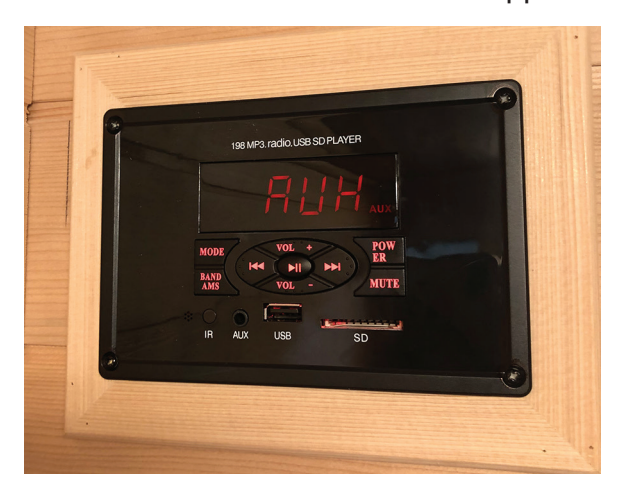
*Other "MODE" options include radio, USB & SD