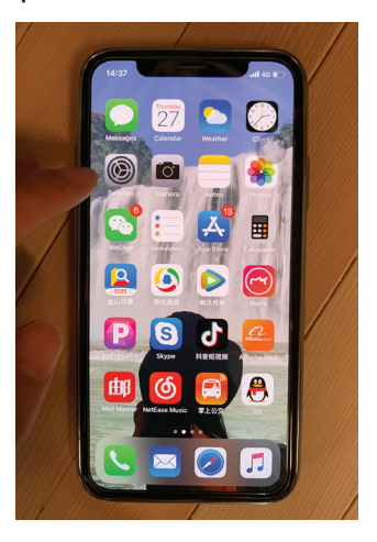
D. Select your music "APP"