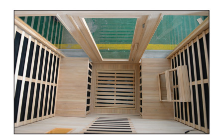
View of sauna inside from above